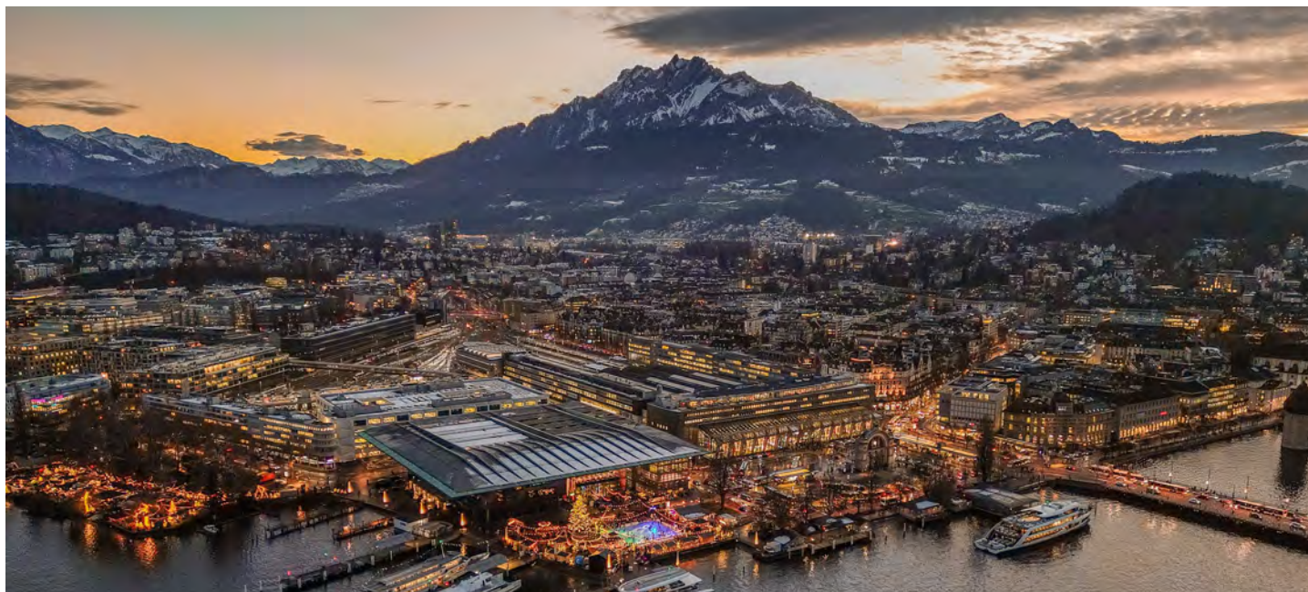
Caption Mount Pilatus above Lucerne at Christmas time