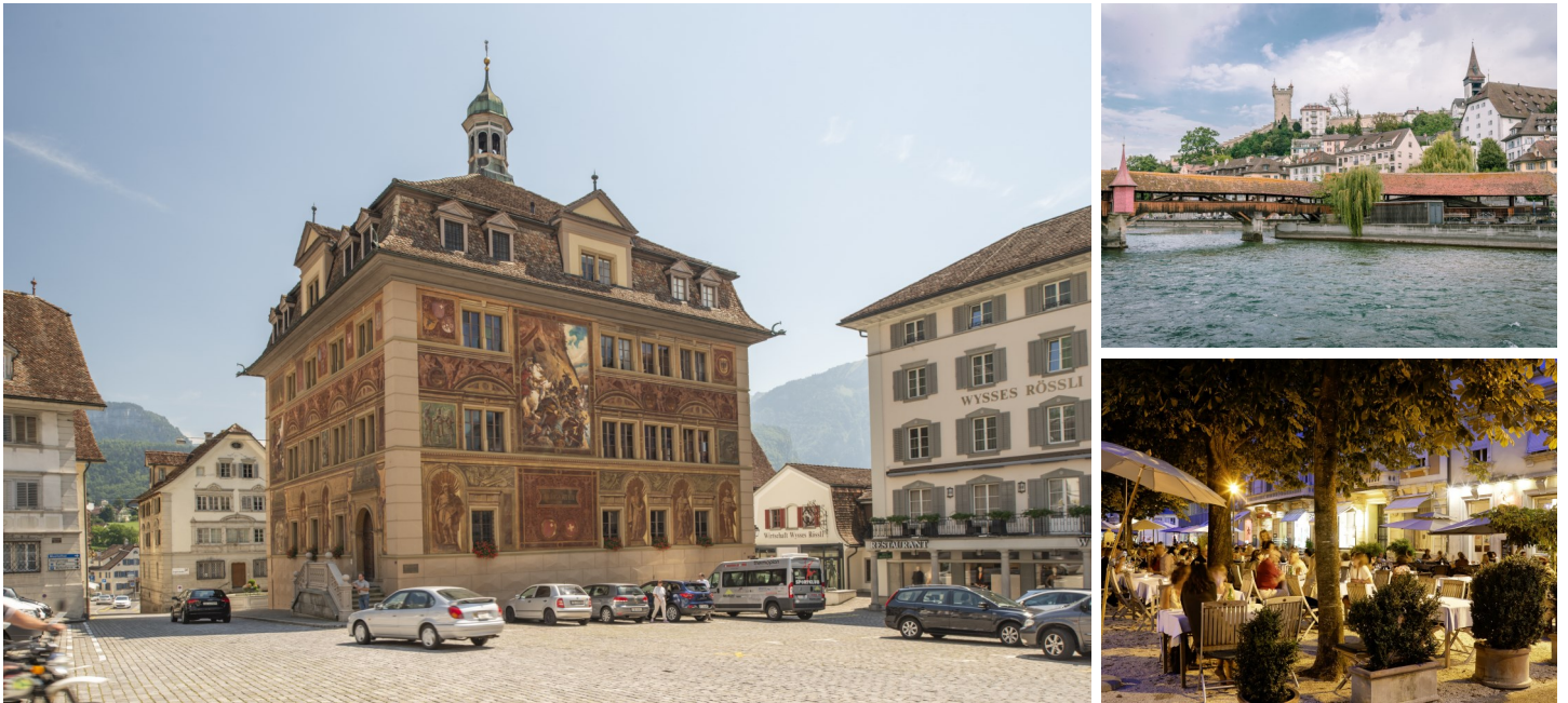
Caption from left to right: Town hall on main square in Schwyz, Spreuer Bridge with Musegg Wall in Lucerne, balmy night in Lucerne's new town