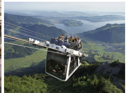
Caption from left to right: Sursee town hall, Winkelried house in Stans, CabriO cable car with open upper deck